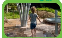
Discover the Dragon's Lair and Splash Play Zone