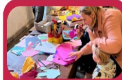
Art Adventurers crafting Thurs 28 th May