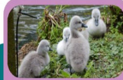
Feed the newly-hatched cygnets*