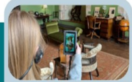
Family multimedia tours of the Palace

Activities included with admission www.bishopspalace.org.uk