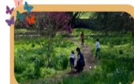
Follow the family trail 23-31 May