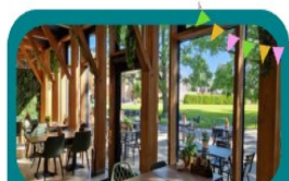
Children's menu in The Bishop's Table café